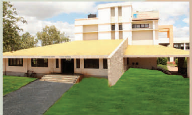
College Canteen & Canara Bank