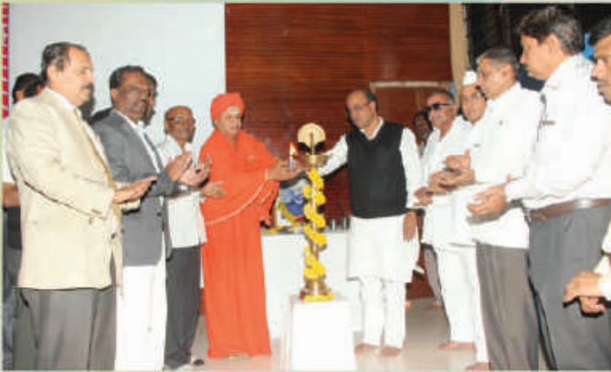
Celebration of Lingaraj Jayanti