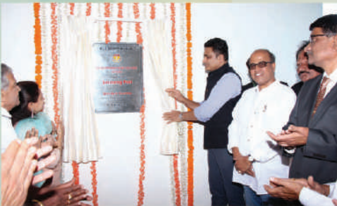
Swimming Pool Inaugurated by Former Team India Captain Anil Kumble