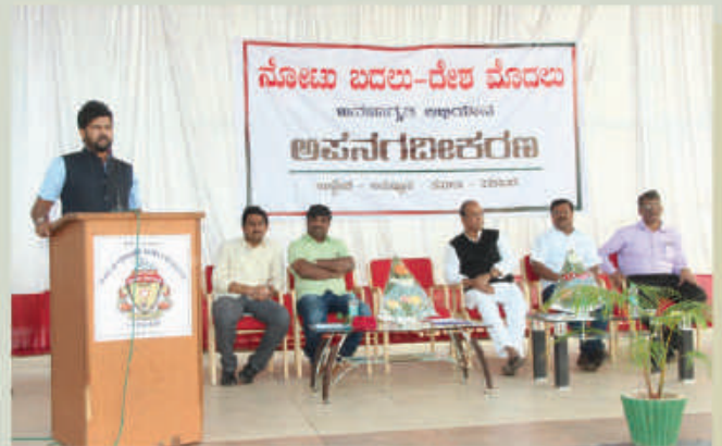
Awareness Programme on Demonetization