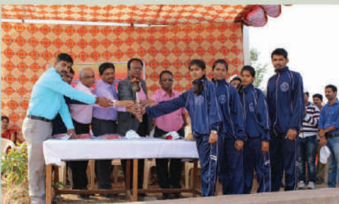
Annual Sports Meet