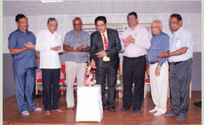
Inauguration of Sports and Cultural Activities